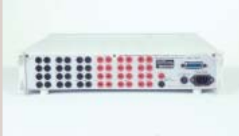
Fully loaded 948i shown with six HV-8 switching cards installed - to form a 2x24 high voltage matrix.

Configuration: 4 channels of high-current relays and 4 channels of sense relays